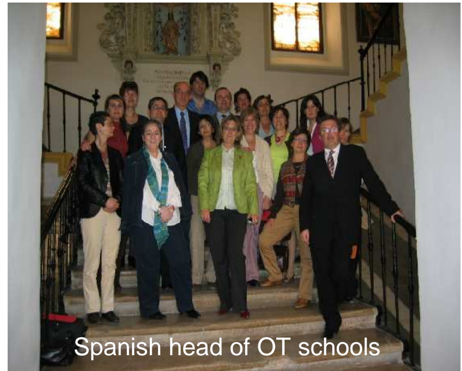
Spanish head of OT schools